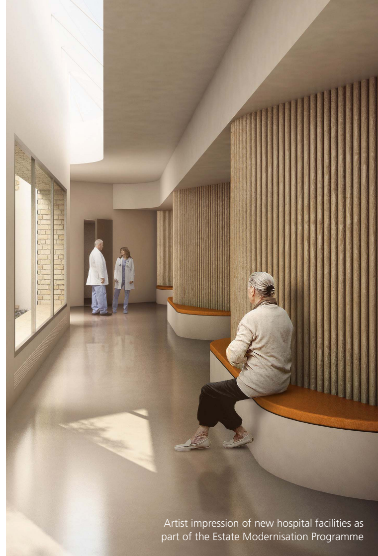
Artist impression of new hospital facilities as part of the Estate Modernisation Programme